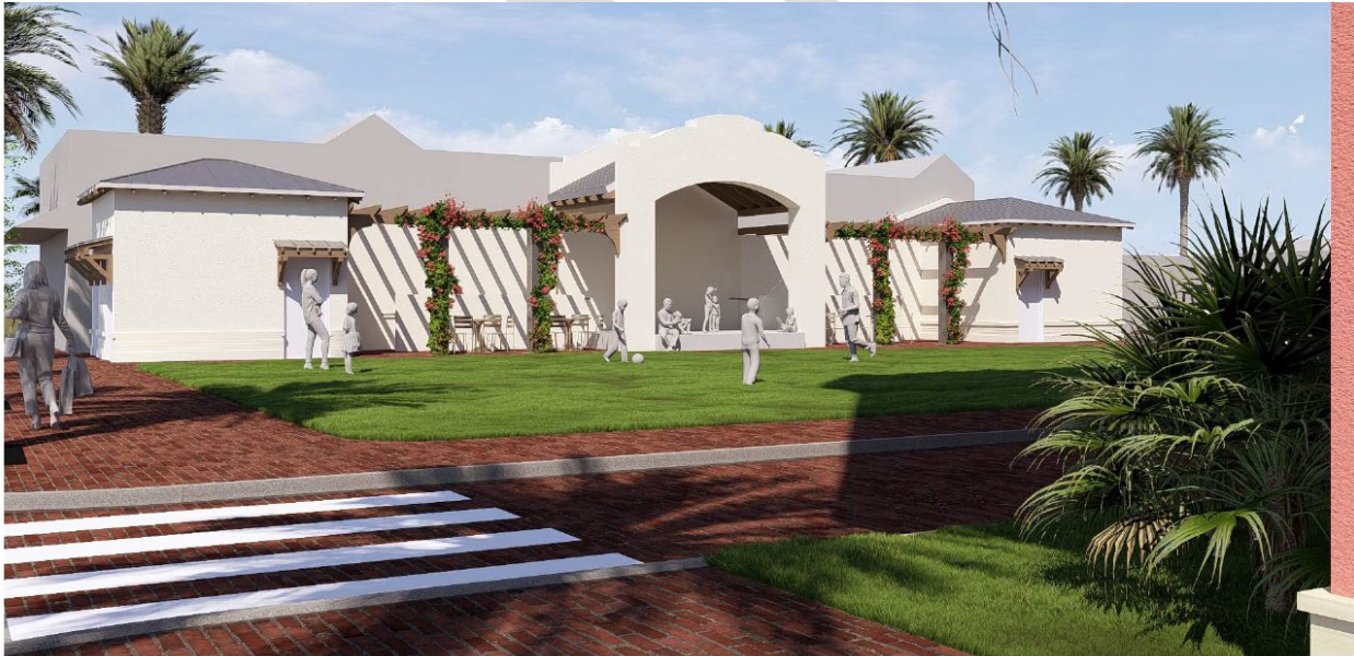
View of Park and Stage